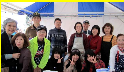
Below: Festival Booth Above: Friends of ours.

FOR PEOPLE WHO LOVE TO SHARE THEIR LIFE WITH OTHERS!